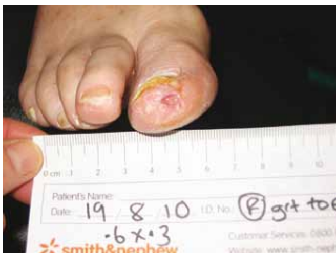
Figure 1 — 19 August pre Flaminal

An 88 year old type 2 diabetic with AF, hypertension and left below knee amputation presented with a neuropathic diabetic ulcer of the right great toe (>1 year duration),