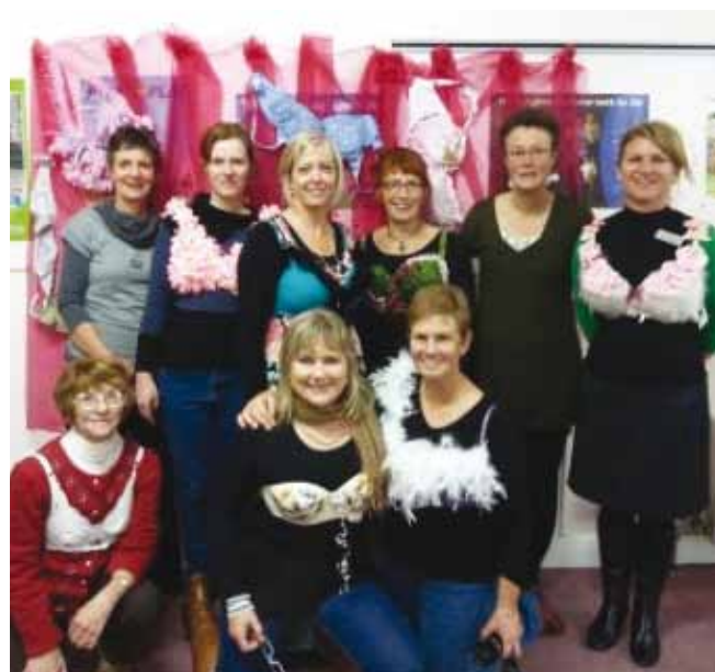
Bay of Plenty NZWCS study day attendees (and their bras!)